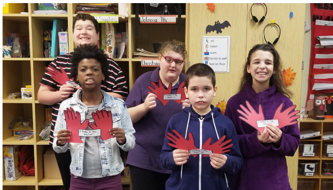
Academic and Behavior School East students show-off their red hands as they pledged to be drug-free during Red Ribbon Week.