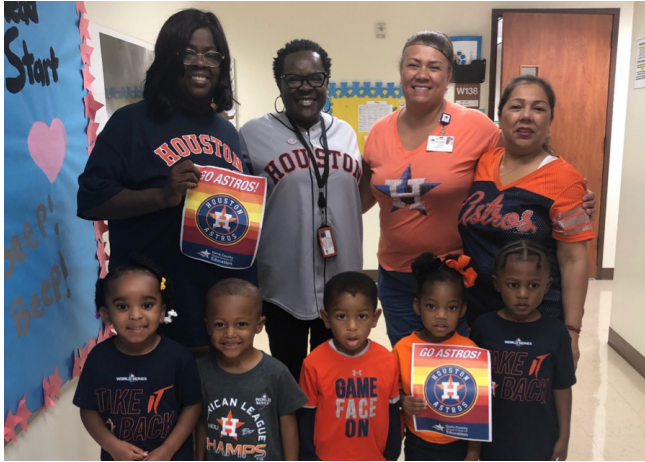
Head Start Fifth Ward gets ready for the Astros game six of the World Series as they return to Houston Oct. 29.