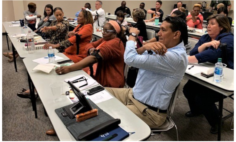
Civilian Response to Active Shooter Events training at North Post Oak provides training in applying a tourniquet as one of the hands-on activities. Topics discussed at the event, sponsored by the Center for Safe and Secure Schools, included stress response, current events and what works and doesn't.