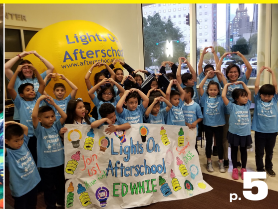
Parents, Students Celebrate Lights On Afterschool