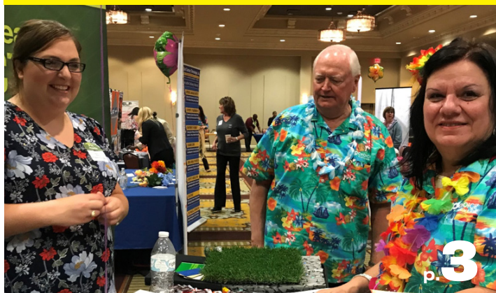
Choice Partners Vendor Exhibit