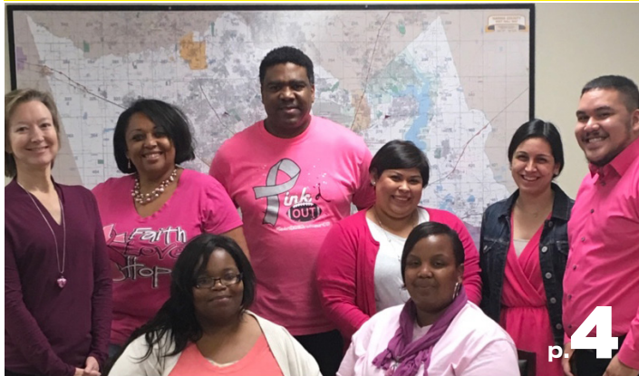
Gearing up for Breast Cancer Awareness