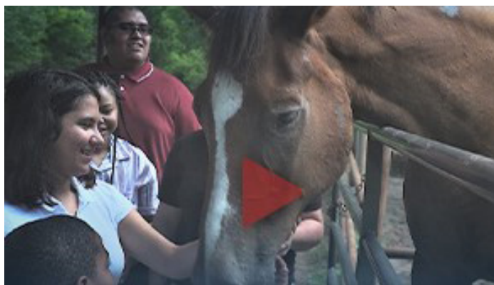
A new HCDE-produced video talks about the merits of equine therapy for students with emotional and intellectual disabilities. The SIRE program will be used at all four HCDE schools this year. View the video: https://youtu.be/rFjsqBgMfB8