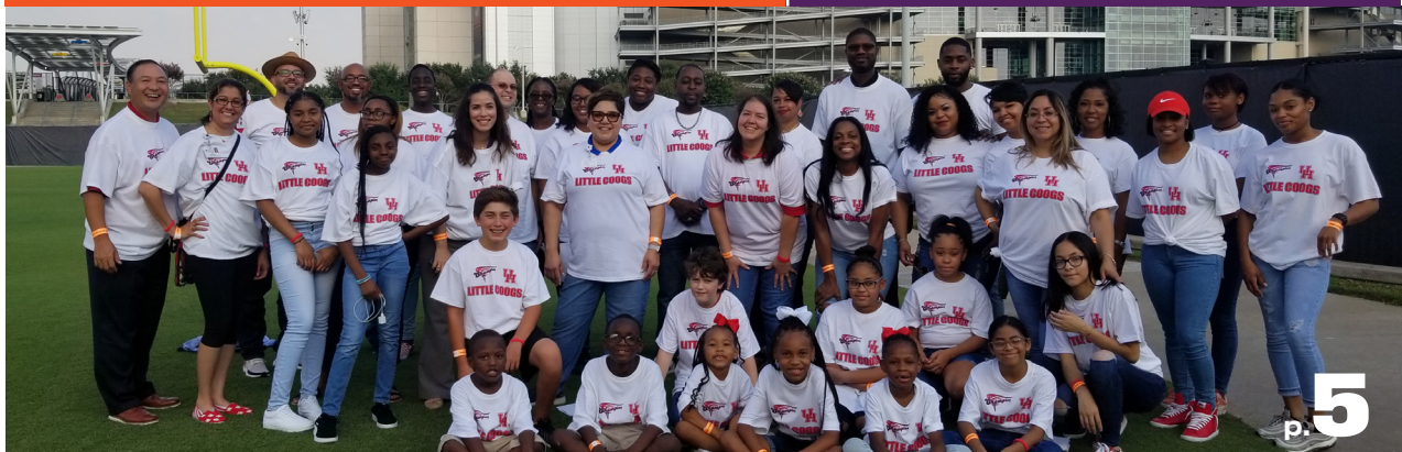
ABS East Staff Holds Flag at UH Football Game