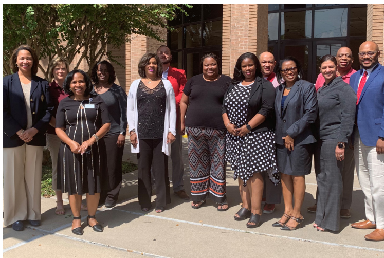
Educator Certification and Advancement welcomed 13 candidates into its 2019-2020 inaugural Superintendent Institute cohort this week. More cohorts may be added to the roster as the month progresses.