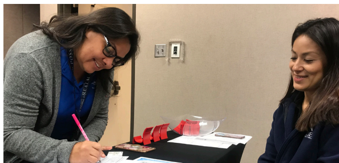
Employees were provided flu shots at both Irvington and North Post Oak locations this week. Aetna provided the shots for free and reduced rates through certain health plans. HEB was the health care provider who administered the shots. Experts predict a robust flu season this year comparable to 2017.