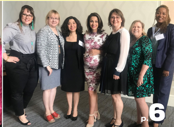
HCDE Honors 5 Area Media Representatives with Media Honor Roll 2019 Awards