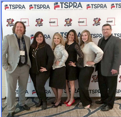
Members of the Harris County Department of Education's Communications and Creative Services and Client Engagement attend the 2019 Texas School Public Relations Association Conference where the team earned 16 awards for work which benefits Harris County students and educators.

Harris County Department of Education communicators earned 16 awards for outstanding education communications from the Texas School Public Relations Association. Communications and Creative Services staff received the awards at the 57th Annual Texas School Public Relations Association Conference in Cedar Creek, Texas on Feb. 20.