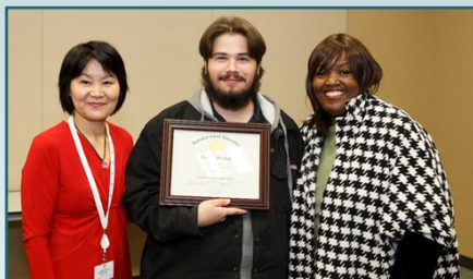
A student from last year's ceremony is congratulated by HCDE Adult Education staff.