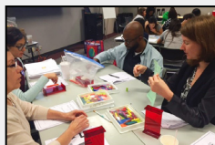
Math Sessions Help Aspiring Teachers with Teaching Models pg. 3