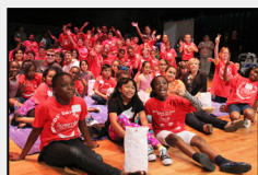
CASE for Kids Hosts Kids' Day at the Hobby Center June 23 pg. 5