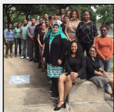
Principal Certification Academy Class of 2015-2016 Completes Preparation for State Principal Certification pg. 3