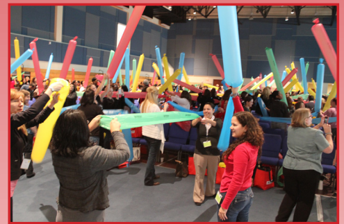
Scene from R.T. Garcia ECWC 2015