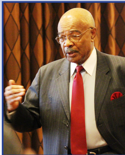
Former United States Department of Education Secretary Dr. Rod Paige presents to superintendents during the TABSE Superintendents' Think Tank Session this week in Austin, Texas during the TASA/TASB Mid-Winter Conference