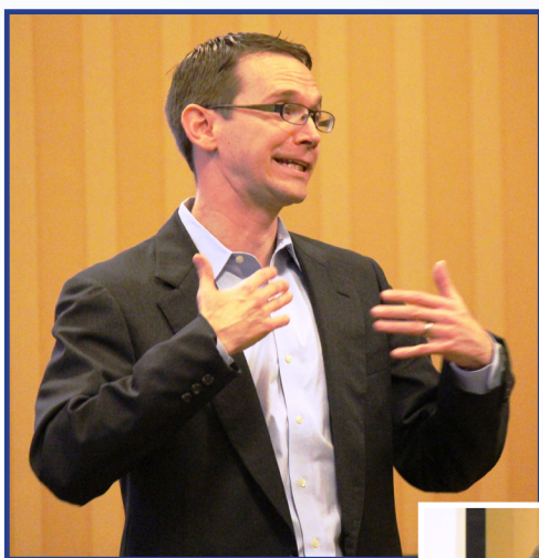
Recently-appointed Commissioner of Education for the State of Texas Mike Morath meets with superintendents from all areas of Texas during Think Tank Session