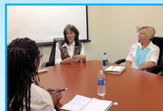
HCDE's Head Start Leadership Team meets with Region 10 colleagues