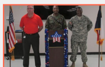
Honoring Our Veterans p. 7

We are moving forward with purposeful intent as we head toward the fall holiday season. This week, I visited our Fifth Ward Head Start location. I was pleased with what is going on at that site. I saw, in action, an education team committed to advancing teaching and learning with students at an early age, ensuring that our youngest learners are equipped for Kindergarten and beyond.