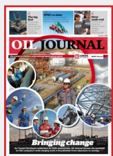
Education Foundation of Harris County in Global Spotlight p. 6