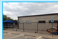
Exterior of Region 10's Early Head Start facility