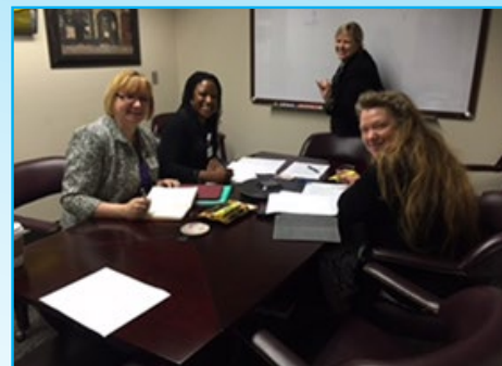
Educator Certification and Professional Development staff collaborate for work session with Center for Grants Development staff