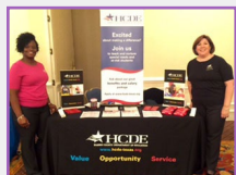
Human Resources Adds New Fair p. 2