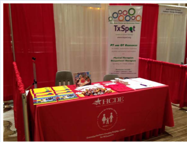
HCDE Therapy Services director Co-Presents Local Occupational Therapy Services Conference