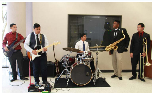
Aldine ISD's MacArthur High School's Jazz Ensemble