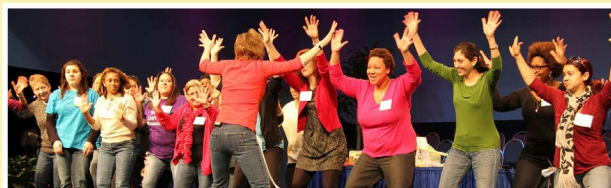
Engaged attendees at 2014 ECWC

The all day event features 90-plus workshop options for early childhood educators. Specialization workshops will focus on subjects such as behavior management, math, science, literacy, technology, bilingual and dual language education, technology, art, and music. Visit www.hcde-texas.org/ECWinterConf for more information.