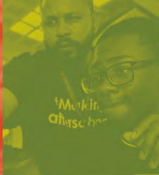
CASE FOR KIDS