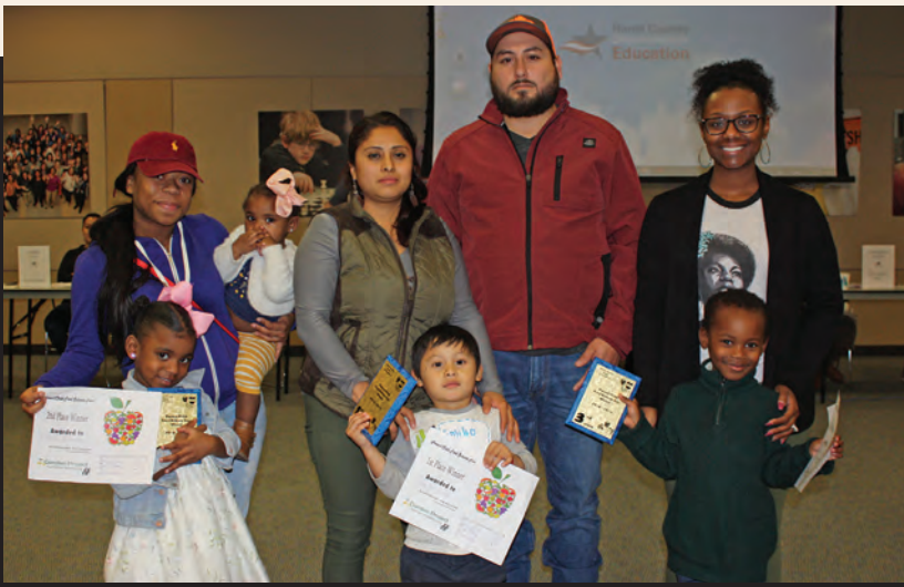
Head Start Food Science Fair Winners