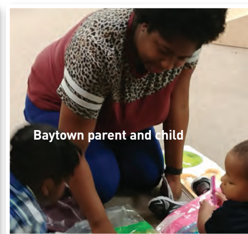
Baytown parent and child