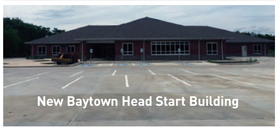
New Baytown Head Start Building