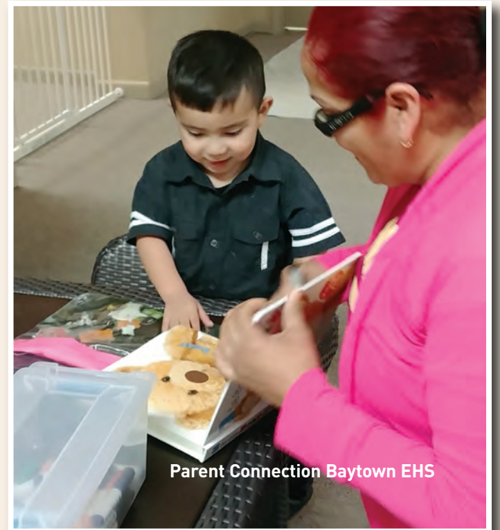
Parent Connection Baytown EHS