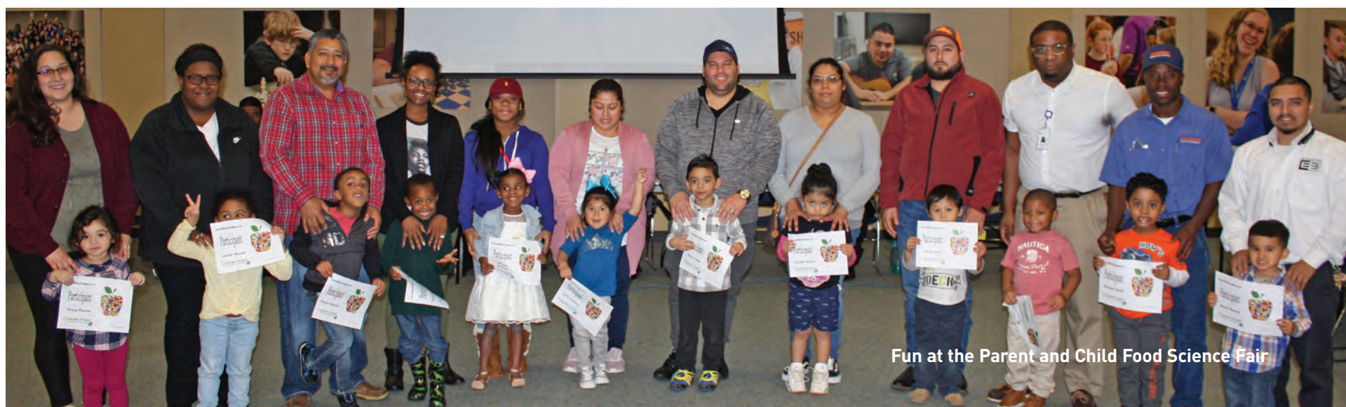
Fun at the Parent and Child Food Science Fair